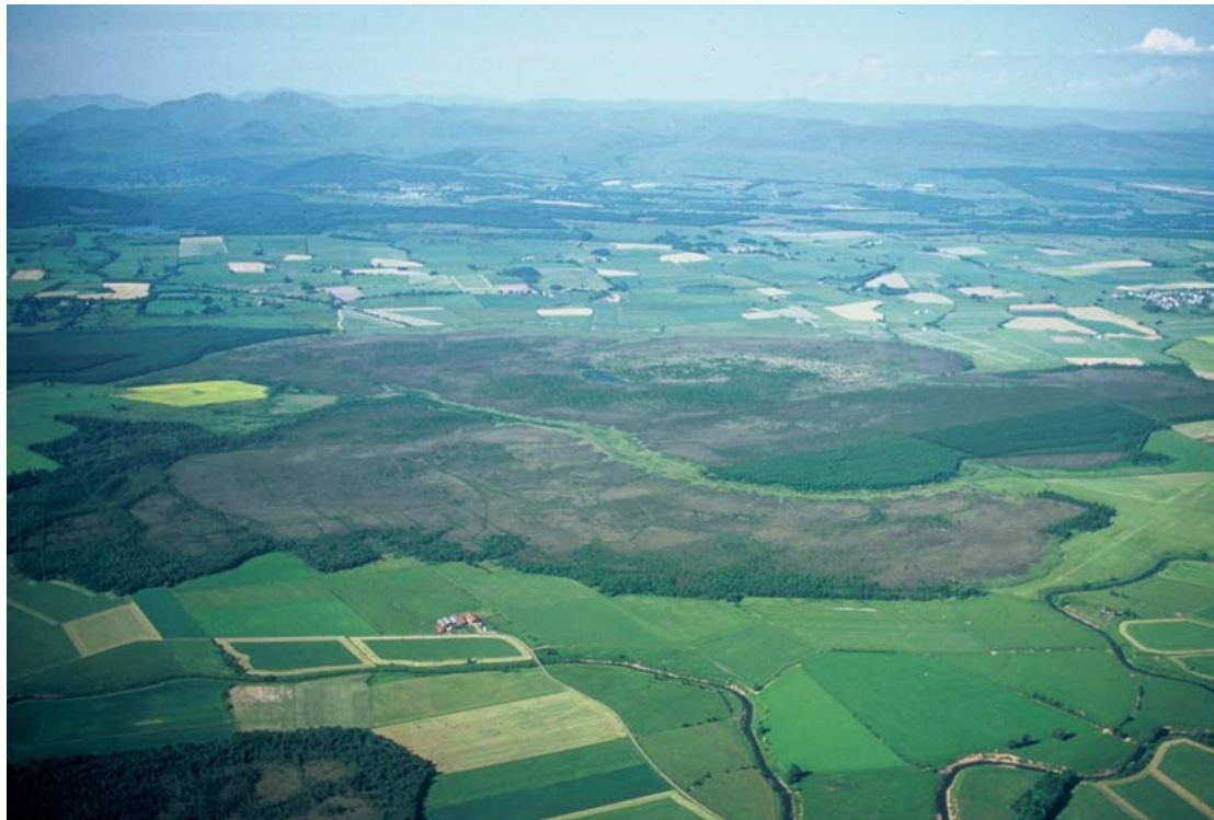
Flanders Moss National Nature Reserve